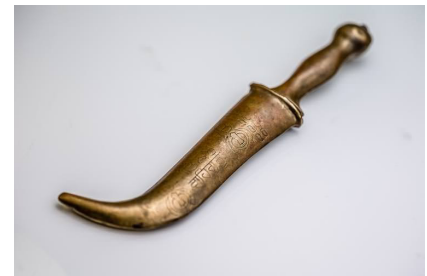
Kirpan (above and below)